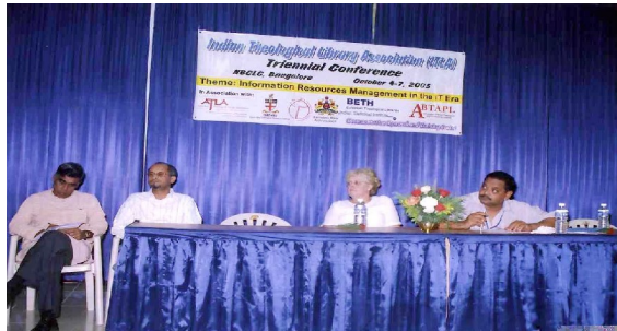
Dignitaries on the stage