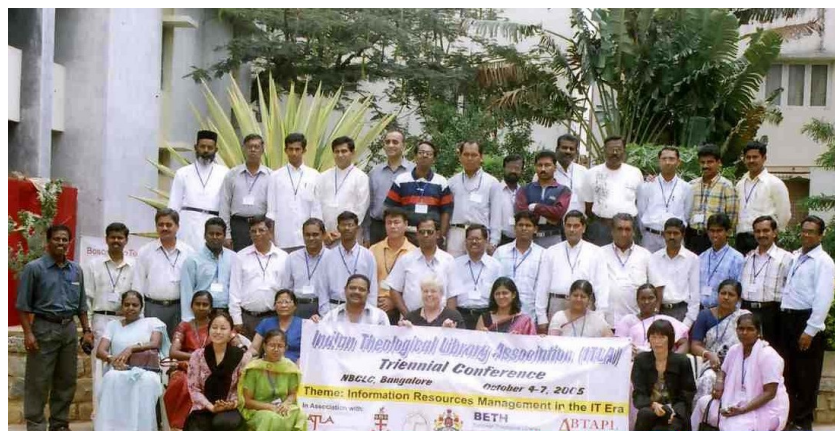
The participants of ITLA Triennial conference 2005