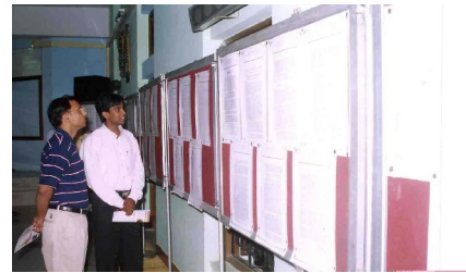
Rare collections from Karnataka State Archives Department