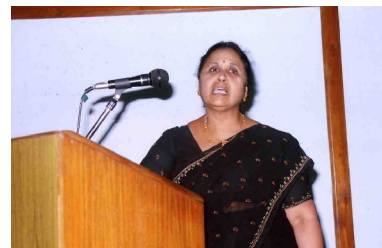
on conservation of books