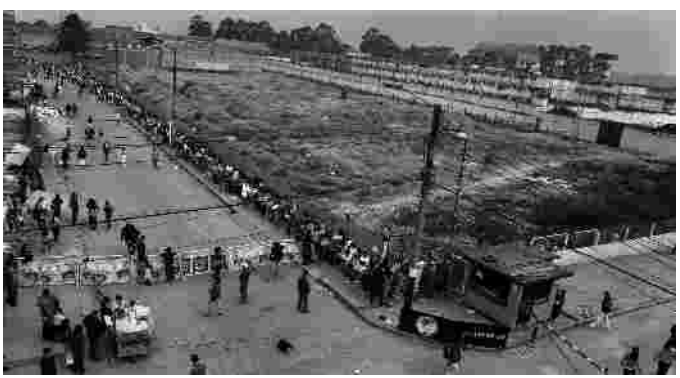
"Family Visiting"

Following my retirement I went from occasional work to fulltime with a Registered Society for the support of offenders (in honorary capacity). This is within the 'Association for Probation and Offenders' Assistance, (chaired by the Chief Public Prosecutor). It is work that I have been doing now for over fifteen years. The primary concern of the organization is to assist ex-offenders back into the community. In this endeavor we are supported and financed by both the local and federal institutions besides by donations and fees. I have no 'formal' voice as such but volunteer mentors like me are fully supported and encouraged by the judicial system.