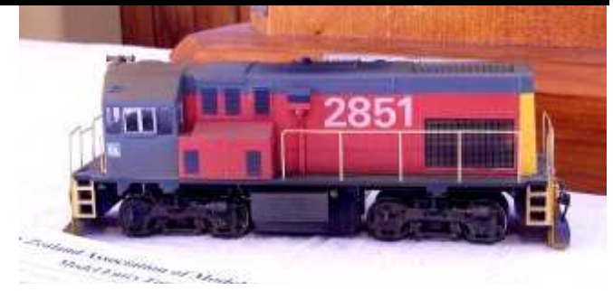
Alec Fenton's 1:64 scale DH Locomotive