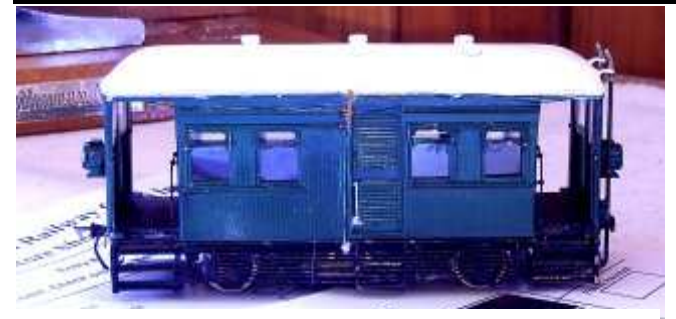
Robin Knight's 1:64 scale McEwen Pratt Railcar