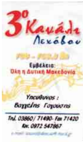
Their home made business card