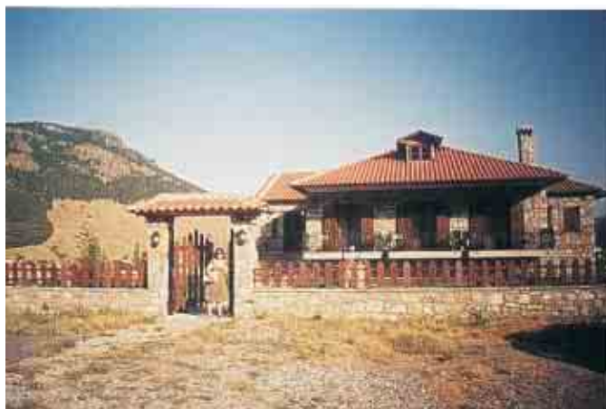
Pic 1 : Photo of Agonari Hostel

Our drive to Nymphaion was quite easy without any problems on the road . We first made a lunch stop at first on Chalkidona a town 20 km west of Thessaloniki then we took the road via Yanitsa .There was an option to use the road via Kozani