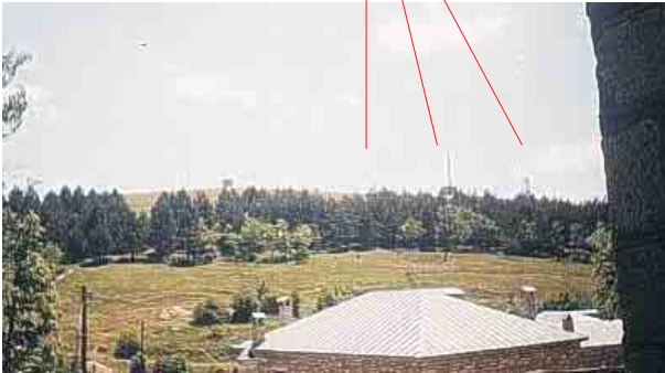
Shot from inside Nymphaion