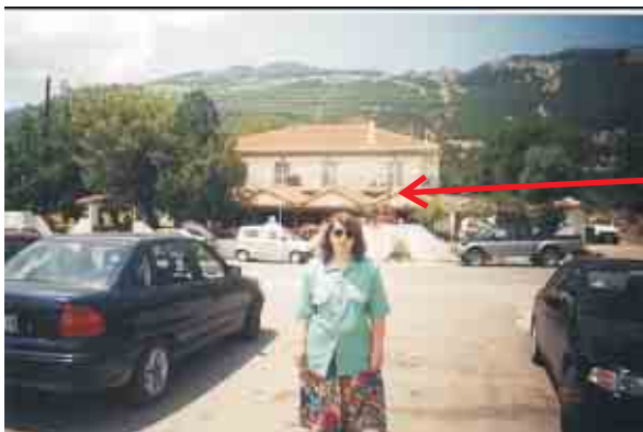
Pic 2: Tavern is shown

At the left side of the hostel there is a big garden and some tables