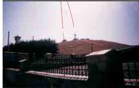
Shot from entrance of Nymphaion

Picture of the 3 towers in the antenna farm, just in the entrance of the village of Nymphaion