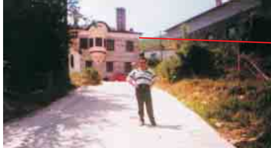
Photo of an extraordinary house on Konitsa

We seen Konitsa only for a little while looking for a new film and a newspaper. The people advised us for sightseeing of the village but it was a bit difficult to see. But we found a very nice building to shoot